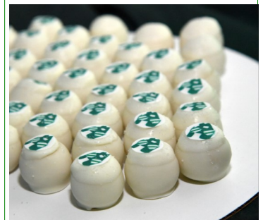
Cake ball dessert with Green Tie logo - too cute to eat - almost!

Saturday, March 24 2018 Seven for Parties Ron Kirk & Matrice Ellis-Kirk Honorary Chairs